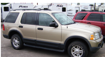
2003 FORD EXPLORER 4WD, leather seats. $200 DOWN