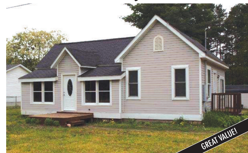
101 WILSON DRIVE • EAST JORDAN • $67,900 Recently updated 3 bedroom home located with in the city limits. New flooring, interior paint, appliance and windows. This home is in turn-key condition and should qualify FHA or RD. Call today to schedule your showing!. MLS 441103. Ask for Mike Stark.