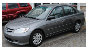
2004 HONDA CIVIC LX 4 door, 5 speed, 109 K, Southern car, no rust, great economy. $600 DOWN