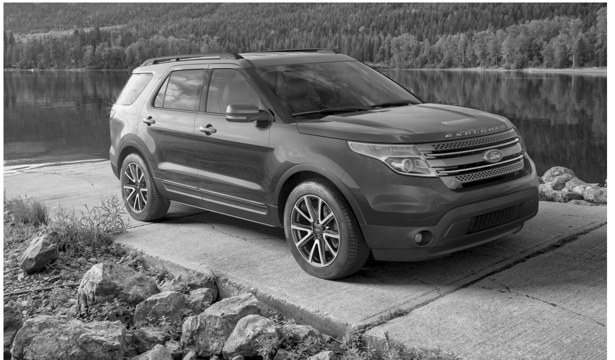
Ford Explorer brings new options to utility vehicle customers for 2015, including a sport-inspired appearance package that raises the bar on comfort and technology without breaking the bank, as well as new colors and features.