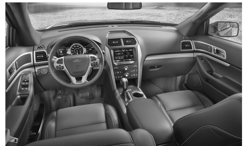
Interior details include leather-trimmed, heated front seats featuring Miko® suede inserts and contrast stitching, floor mats with special badging and auto-dimming rearview mirror.

Since 2009, Explorer has contributed 21 percent to Ford's overall growth in retail registrations within this coveted demo-