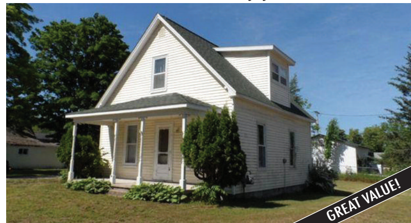
908 PLEASANT AVENUE, BOYNE CITY • $79,900 In town Boyne City w/ a great location and good size lots for room to play! 3 bed, 1.5 bath making it a perfect starter home or investor opportunity. Some updates have already been made and some are waiting for your personal touch...either way move in and enjoy! Call today to schedule your showing! MLS 441099. Ask for Jennifer Burr.