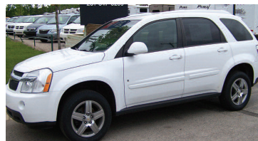
2008 CHEVY EQUINOX Leather, low miles. SALE PRICE $11,995