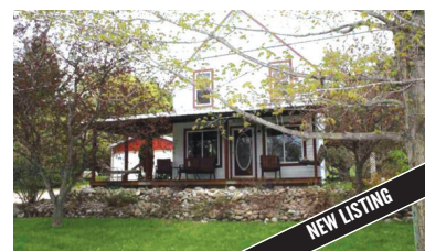
05382 MILES ROAD, EAST JORDAN Four bedroom 1 1/2 bath home has real hard wood floor through out. 2-car garage, barn, lean to, and bonus garage. MLS 440671. Ask for Mike Stark. $169,900