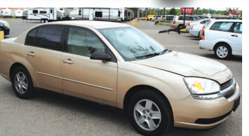
2005 CHEVY MALIBU Great fuel economy, family vehicle. $200 DOWN