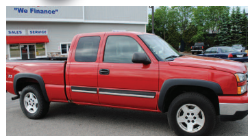
2004 CHEVY SILVERADO LT 4x4, Z-71 Off Road, bedliner, tow pkg, V-8. AS LOW AS $169 A MONTH