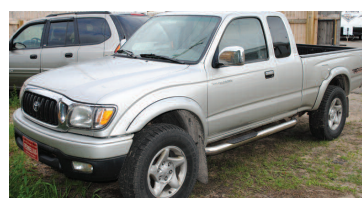
2003 TOYOTA TACOMA LIMITED EXT CAB 4WD, TRD Off Road, tow pkg, bedliner, sunroof, Pioneer sound. $500 DOWN