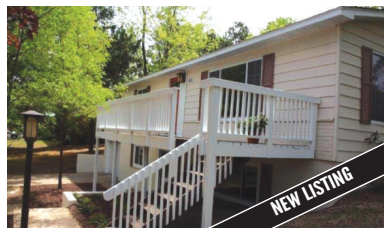
326 E LINCOLN STREET, BOYNE CITY Beautifully renovated ranch style 3 bedroom home. Many updates have been completed including, new furnace, roof & windows. MLS 440958. Ask for Mike Stark. $114,900