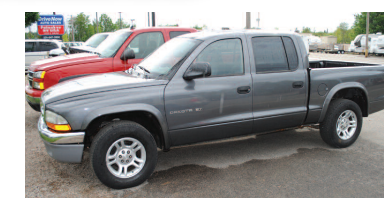
2002 DODGE DAKOTA SLT CREW CAB 4 door, low miles, rust free, bedliner, tow pkg. $500 DOWN