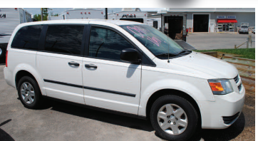
2008 DODGE GRAND CARAVAN C/V Cargo van. $1000 DOWN