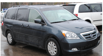
2005 HONDA ODYSSEY Touring pkg, leather, loaded. SALE PRICE $8,995