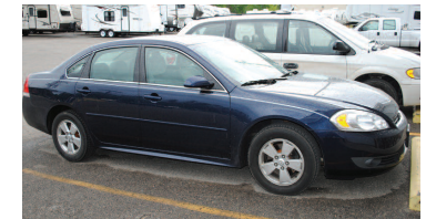
2010 CHEVY IMPALA Southern car, no rust, great gas mileage. SALE PRICE $10,995