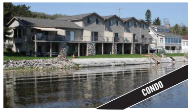
2540 S M-66 HIGHWAY, EAST JORDAN 2199sq ft condo with 22ft waterfront on the SOUTH ARM of LAKE CHARLEVOIX. 3 BR, 3 1/2 BA, new deep water boat slip. MLS 440455. Ask for Mike Stark. $299,900