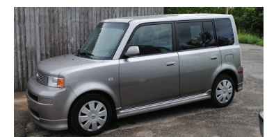
2006 SCION XB. Only 93 K, lots of room, great economy. $800 DOWN