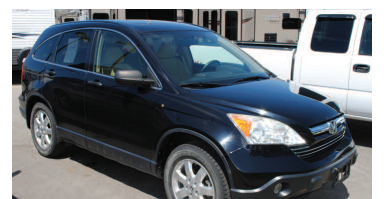
2009 HONDA CR-V AWD, great fuel economy. SALE PRICE $12,495