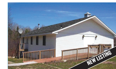
812 ERIE STREET, EAST JORDAN Endless possibilities! 4.88 acres within the city limits of East Jordan. Was once used as a church. Large parking lot. MLS 440333. Ask for Mike Stark. $99,900

109 Mill Street • East Jordan • 231-536-7700