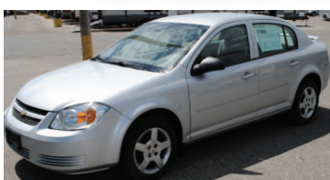
2007 CHEVY COBALT Low miles, fuel saver. $500 DOWN