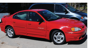
2004 PONTIAC GRAND AM GT Sporty, fun to drive. $500 DOWN