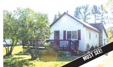
405 UNION STREET, EAST JORDAN What an amazing backyard, a fire pit with hand carved logs to sit on for entertaining, great landscaping and a deck too. MLS 438606. Ask for Holly Nierman. $74,900