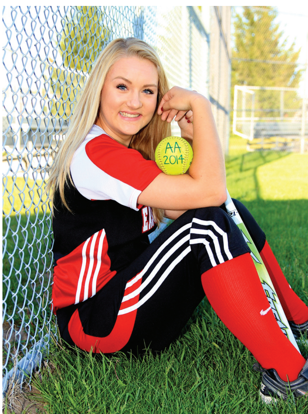
Lindsey Graham EAST JORDAN