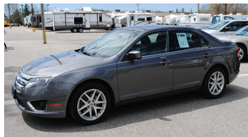
2011 FORD FUSION SEL Great gas mileage, loaded. AS LOW AS $199 A MONTH