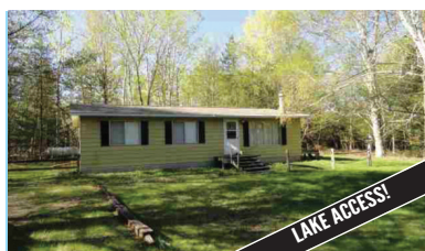
03653 COMMODORE DRIVE, EAST JORDAN Friendly community with private boat slips, sandy beach and family picnic area. Three BR, 1.5BA w/ Lake Charlevoix access! MLS 436953. Ask for Mike Stark. $84,900