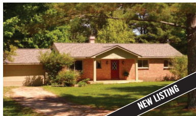
3680 N US 31 • KEWADIN Beautifully updated ranch with 44 feet of shared frontage on Torch Lake. Great year around home or Up North get away. MLS 440881. Ask for Mike Stark. $94,900