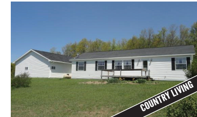
2403 W M-32, EAST JORDAN This 3 bed 2 bath home sits in a beautiful countryside setting including 8 acres. Garage is attached and heated. MLS 440704. Ask for Jennifer Burr. $149,000