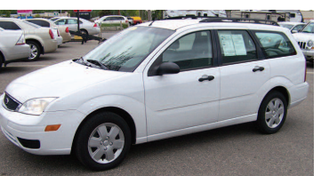
2006 FORD FOCUS WAGON Great economy, lots of room. $200 DOWN