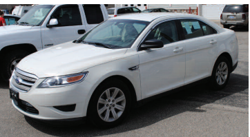
2011 FORD TAURUS Save $2,000. SALE PRICE $14,295