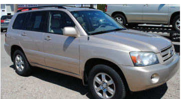
2004 TOYOTA HIGHLANDER 4WD, loaded. AS LOW AS $179 A MONTH