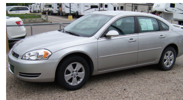
2008 CHEVY IMPALA Only 32 K. AS LOW AS $199 A MONTH