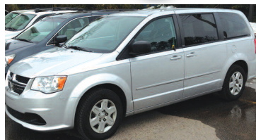
2011 DODGE GRAND CARAVAN Stow-N-Go seating. SALE PRICE $13,995